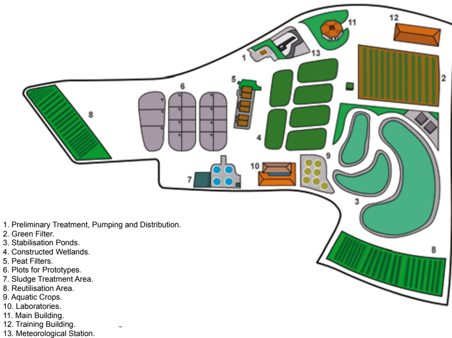
Figure 1. The Carrión de los Céspedes Experimental Plant. Spain. (Fahd et al., 2007).